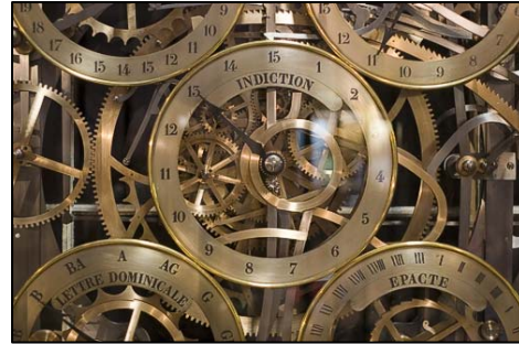
Figure 6. Gears of Comput Ecclesiastique .

when Romanticism was in vogue with astrology making yet another comeback. However, Goethe, one of its most influential fans of the cosmic art, left Strasbourg nearly a half-century earlier in 1771. 66 It's possible that some Church authorities adamantly against astrology preferred to enforce Pope Sixtus V's 1586 bull, Coeli et terrae , condemning judicial astrology. If this were the case, however, it could have been easily outweighed due to Strasbourg's tradition, considering the cathedral had housed an astronomical clock for five centuries which contributed to the city's pride, since few others could boast having one as ornate as theirs which, combined with the current interest in astronomy, provided the Church with the opportunity to use the clock also to show its support of science.