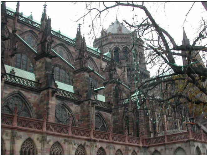
Figure 9. Strasbourg Cathedral

By turning to divination, a person turns away from God. Instead of trusting God to reveal His plans and to care for His children, a person who consults horoscopes places his trust in other human beings. Someone who is involved with any form of divination also opens himself to the occult—to Satan rather than to God. 71