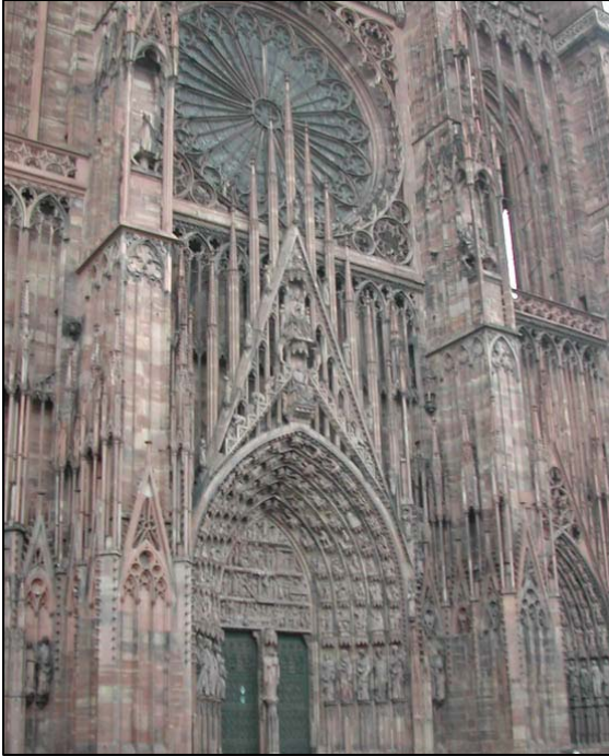
Figure 2. Strasbourg Cathedral.

Renaissance,” 34 found favor with banker Cosimo de Medici who set him up in a villa above Florence where he proceeded to translate classical and Hellenistic work and add commentaries as he sought to reconcile pagan and Christian beliefs. He believed that the Hermetic and Christian gods were similar and that there was a “ prisca theologia ” or original pure religion which had been embraced by Zoraster, Hermes, Orpheus, Pythagoras and Plato. (Besides this “high priest of the Neo-Platonic cult” another frequent visitor to the Medici villa was the artist Sandro Botticelli, whose style also opened up new vistas and may have found his inspiration from Ficino’s philosophies, showing how religion and art mingled together during that time. 35 )