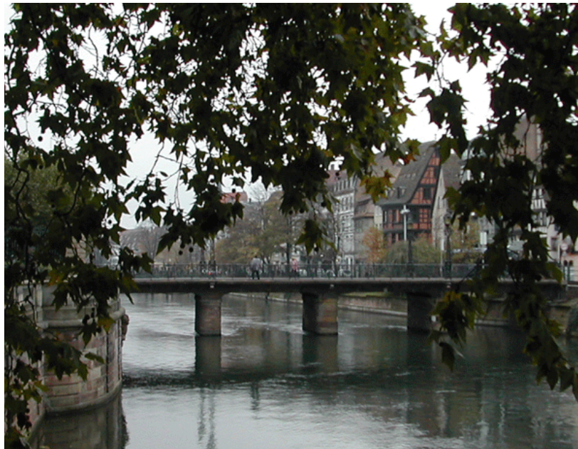
Figure 10. Le Petit France District, Strasbourg.