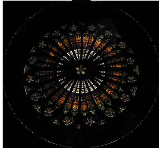
Figure 1. Rose Window Strasbourg Cathedral.

Construction of the Cathédrale Notre-Dame de Strasbourg began during the Early Gothic Period (1140-1194) when similarly ornate religious structures were springing up throughout Christendom; other cathedrals begun during this period include Laon (1190); Chartres (1194); Bourges (1195); and Notre Dame Paris (1215) with numerous others following and eventually spreading to Germany, England and Italy. 5 There were notable similarities associated with these eglises magnifiques including rose windows, a complex design of stone-set glass which originated with Jean de Chelles and creates a “‘multifoliate rose’ of light, ever-changing in hue and intensity with the hours of the day, seems to turn solid architecture into a floating vision of the celestial heavens—a constellation of radiant, jewel-like stars.” 6 As speculative as it may be, it’s worth noting in the context of astrology that Bernadette Brady implies that the first “rose window” was indeed a map of circumpolar stars. 7