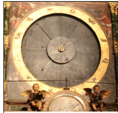
Figure 7. Planetary Dial.

Above the doubled-handed “normal” clock is the planetary dial which is rimmed by the signs of the zodiac divided into 360 degrees. The Sun is at the center with representations of Mercury, Venus, Earth, the Moon, Mars, Jupiter and Saturn shown in their current zodiacal location to one hundred-millionth scale. Above the planetary dial is a lunar globe, half blackened and half gilded, to display the lunar phases throughout the lunar month of 29 days and 55 minutes. To once again quote Lezni: