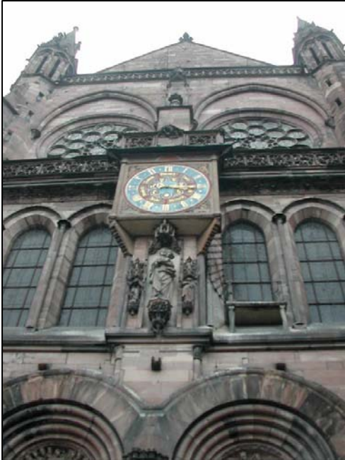
Figure 4. Outside Clock, Strasbourg Cathedral.