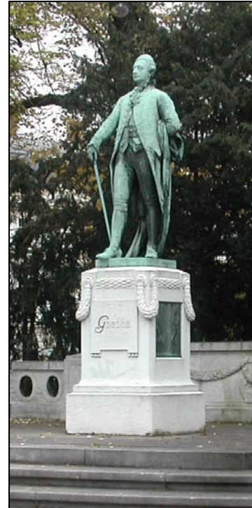
Figure 5. Johann Wolfgang von Goethe statue, Strasbourg France.